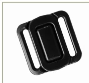
front side possible with logo

reversible - use this closure on both sides