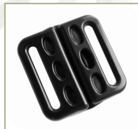
back side olive design