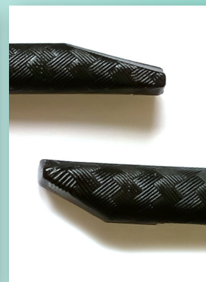
angled end (for towels)