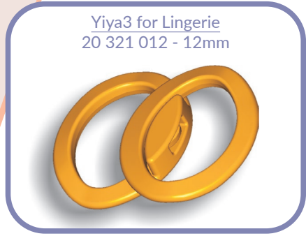
Yiya3 for Lingerie 20 321 012 - 12mm